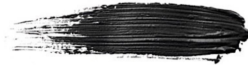
Royal Black 18ml cod. E15-35 7ml cod. E5-35

Warm Black: Permanent makeup color for eyes and eyeliner. Biotek's Warm Black pigment is an intense and warm black, ideal for graphic eyeliner and infralashes.