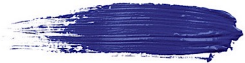
Deep Ocean 18ml cod. E15-40 7ml cod. E5-40

Warm Brown: Permanent makeup color for eyes and eyeliner. Biotek's Warm Brown pigment is a rich and intense brown, ideal for graphic eyeliner and infralashes on blonds.