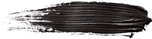
Warm Black 18ml cod. E15-34 7ml cod. E5-34

Warm Black: Permanent makeup color for eyes and eyeliner. Biotek's Warm Black pigment is an intense and warm black, ideal for graphic eyeliner and infralashes.