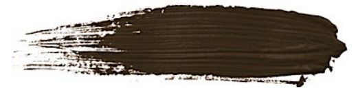
Warm Brown 18ml cod. E15-36 7ml cod. E5-36

Royal Black: Permanent makeup color for eyes and eyeliner. Biotek's Royal Black pigment is a long-lasting intense black, ideal for graphic eyeliner and infralashes.