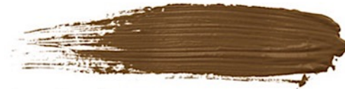
San Paolo 18ml cod. E15-06 Warm Light Brown 7ml cod. E5-06

Warm blond color for eyebrows. Berlin has a slight red tendency. Ideal for working on fair skins with a cold undertone, or for correcting eyebrows slightly turned to gray.