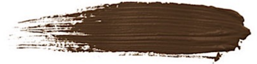
Rome 18ml cod. E15-09 Warm Brown 7ml cod. E5-09

Warm brown color for eyebrows. Rome has a slight red tendency. Ideal for working on people with a cold undertones, or for correcting slightly gray eyebrows.