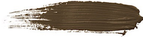
Portofino 18ml cod. E15-07 Cold Brown 7ml cod. E5-07

Cold brown color for eyebrows. Portofino has a slight cold / green tendency.. Ideal for working on skin with warm undertones or for correcting eyebrows that have turned slightly red.