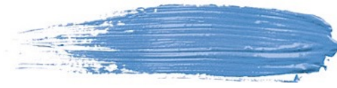
Blue Sky 18ml cod. E15-38 7ml cod. E5-38

Deep Ocean: Permanent makeup color for eyes and eyeliner. Biotek's Deep Ocean pigment is an intense blue, ideal for a graphic eyeliner or a shaded eyeliner.